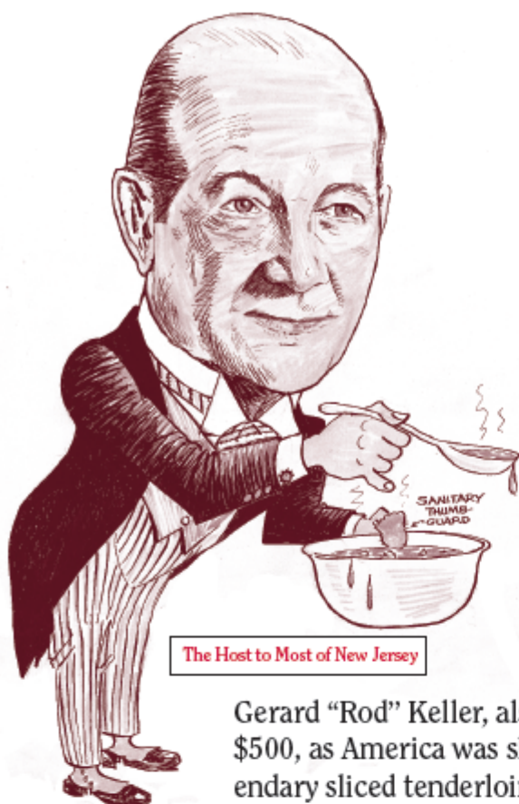
The Host to Most of New Jersey