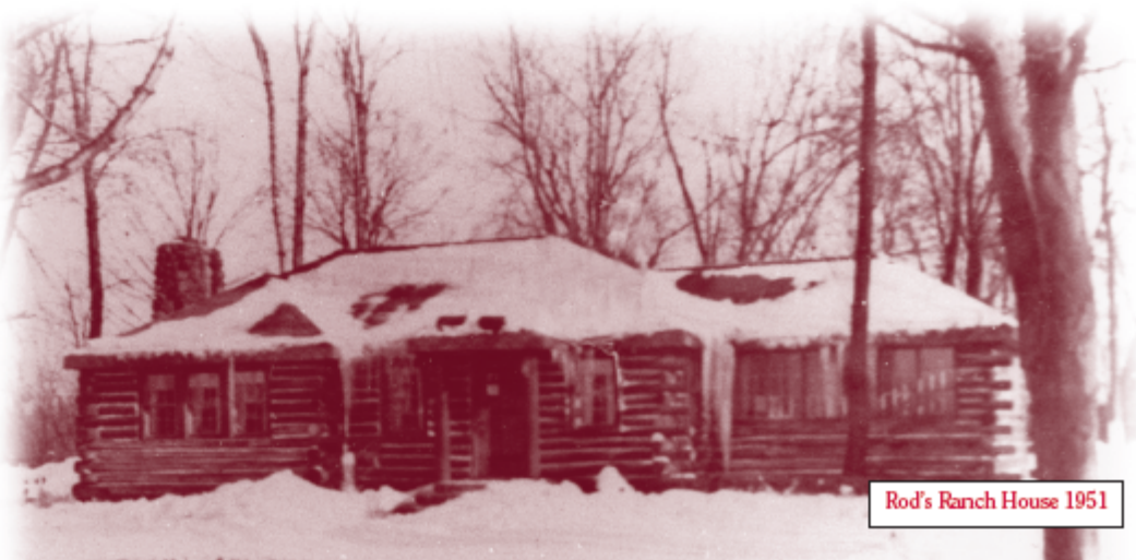
Rod's Ranch House 1951